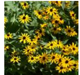
Black eyed Susan